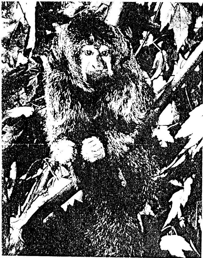
hairy saki monkey