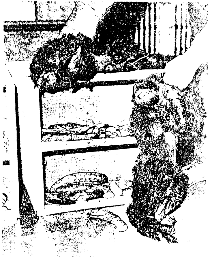
smuggled saki monkeys dead at Heathrow airport