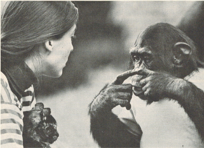
Nim and Trainer

Following the adverse publicity, New York University shipped Nim and Ally back to Oklahoma. The "non-signing" chimpanzees and the "non-famous" signing chimpanzees remain at the New York laboratory.