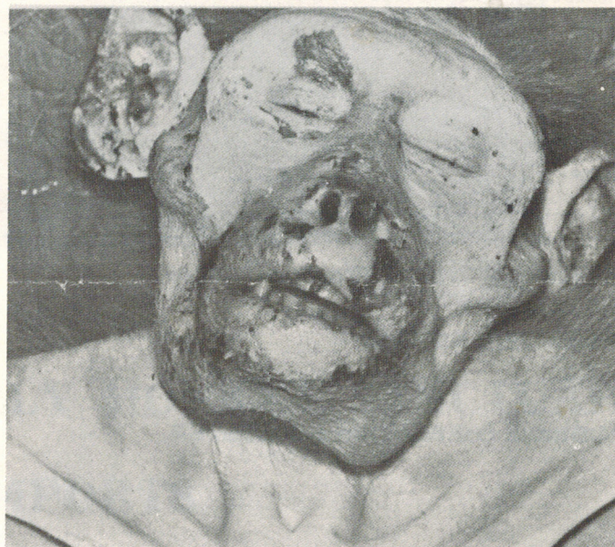
Mystery Case 13