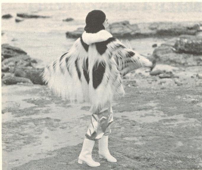
Colobus Monkey Coat