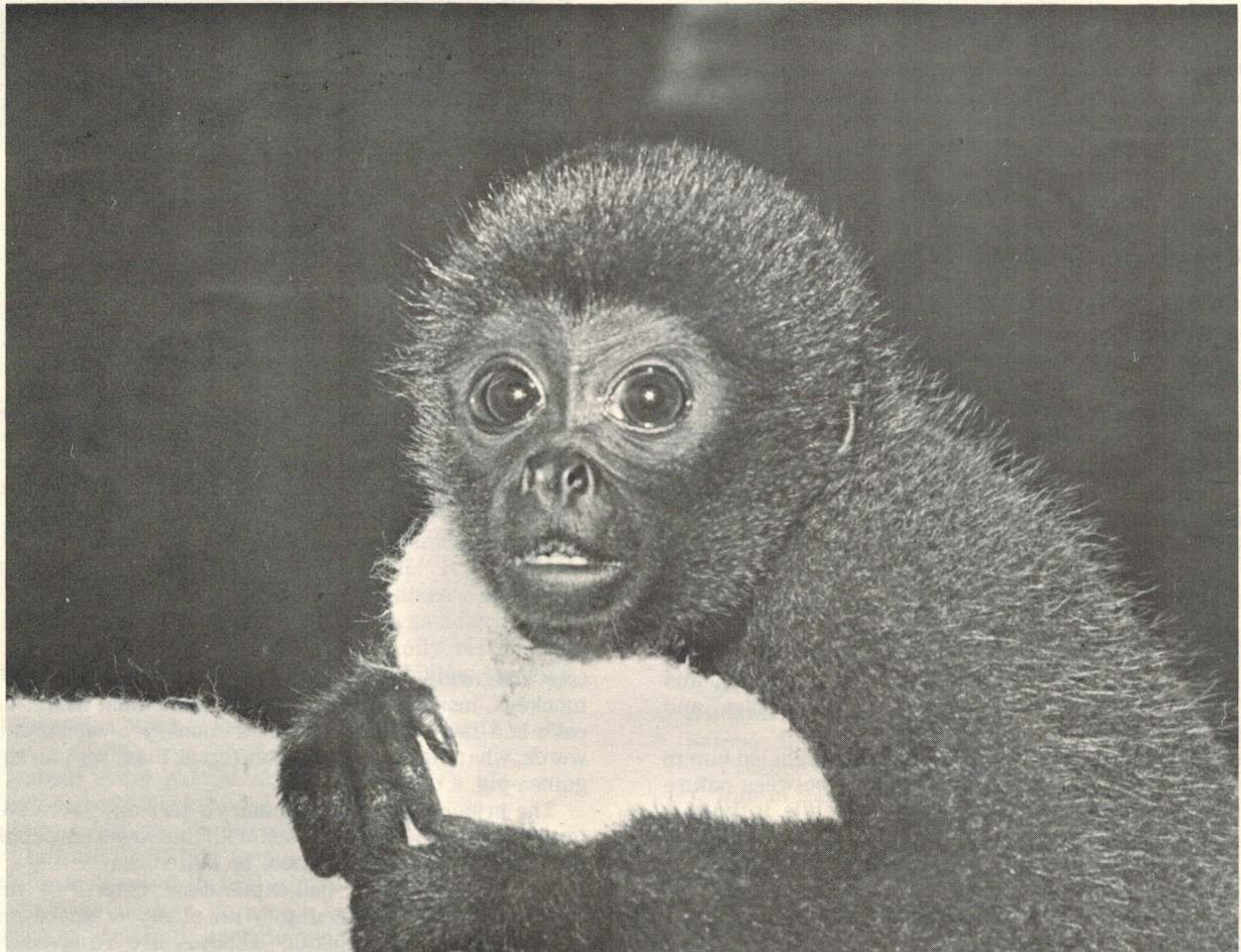
WOOLLY MONKEY

INSIDE: ENGLAND'S WOOLLY MONKEY SANCTUARY. JAPANESE APE IMPORTS