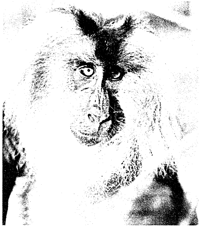
Lion-tailed macaque

The need for this specialized habitat is not the only factor that has caused the rapid decline in the population of this species. They are slow breeders. The female conceives only about once every five years. Usually, a single baby is born, with pale pink skin and brown hair. In some rare cases, twins are born. Their feeding range is also quite wide. It has been estimated that each animal needs about 8 square kilometers of rain forest for foraging. This has to be a continuous forest strip allowing continuous passage through the trees by "monkey pathways." Of all the 12 species of macaques, only the Lion-tails are exclusive to tropical rain forests and truly arboreal.