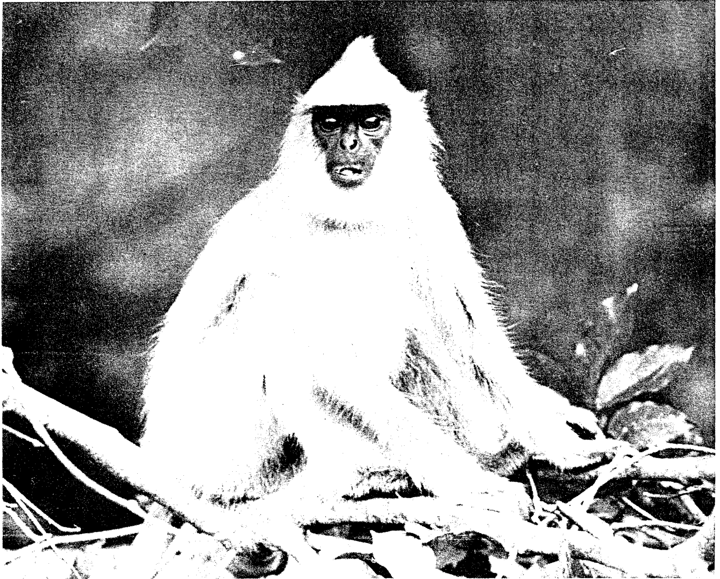
Hanuman Langur