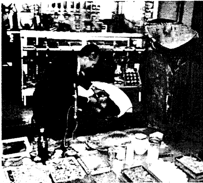
Orang being "made up"

The orang-utan is an endangered species totally protected in its entire habitat range. Yet IPPL receives frequent reports of young animals being smuggled from Sumatra or Borneo, usually on logging ships, to Taiwan.