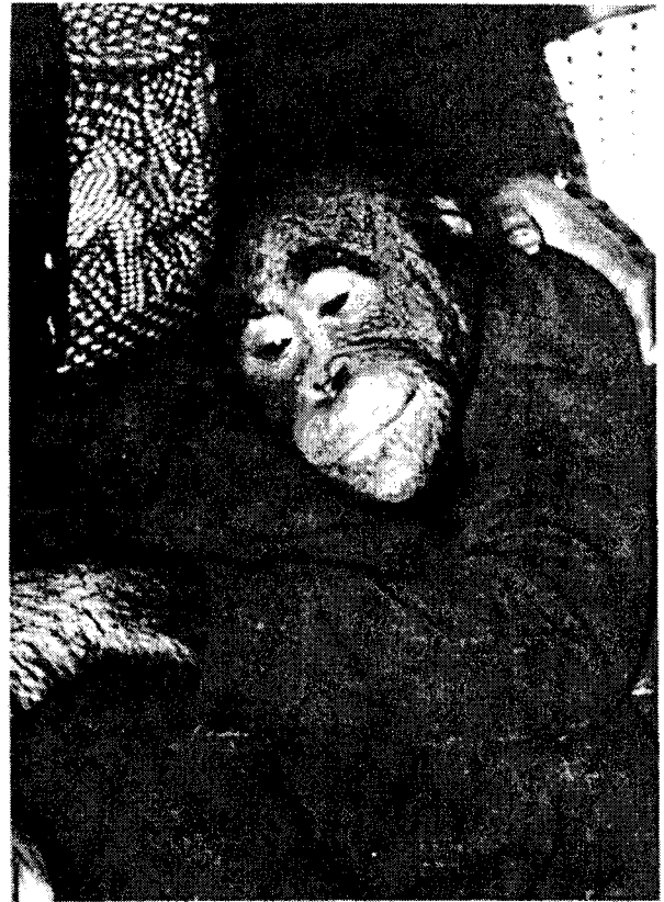
Cowering in fear of crowds

IPPL has the name, address, and phone number of this dealer. Should any member be passing through Taiwan, please let us know in advance. We are exploring ways to try to get this poor animal, and others like him, seized and sent for rehabilitation to the wild. This racket must cause unbelievable mental and physical suffering to the orang-utans involved.