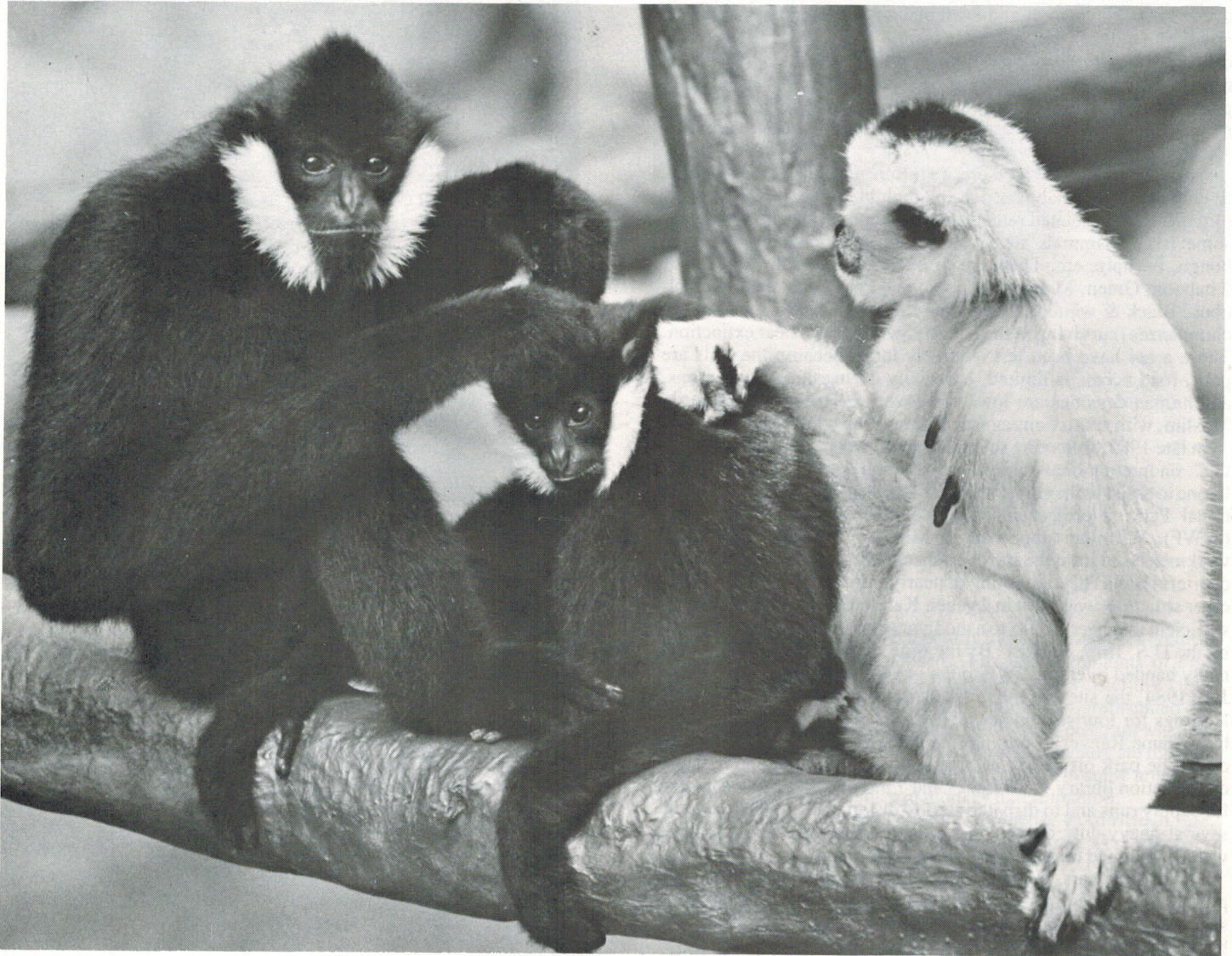
White-cheeked Gibbon Family.

INSIDE: SIERRA LEONE ESTABLISHES ITS FIRST NATIONAL PARK IN CHIMP TERRITORY