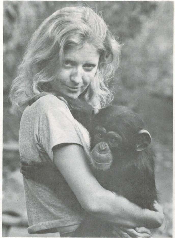
The Author with a Special Friend.

As none of the staff except the Senior Game Rangers had previous training, education programs were initiated on species identification, and on the purposes of nature conservation. All staff participated in assisting visiting scientists conducting field studies. Once