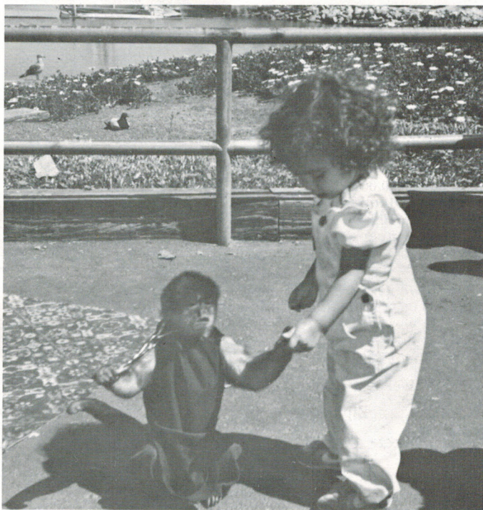
Monterey Pier Monkey.

Other attractions involving monkeys that are occasionally seen are acts in which a monkey does a dive from a high tower into a water-tank, sometimes as part of a "diving mule" act. Although some monkeys can dive, forcing them to do so from high towers is both hazardous and cruel.