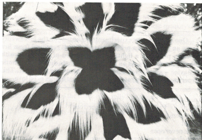
Colobus monkey skin rug.

IPPL deplores the giving of wildlife or wildlife products as gifts to foreign dignitaries, especially when the wildlife is supposedly protected under the Convention on International Trade in Endangered Species, to which both Kenya and the Cameroun belong.