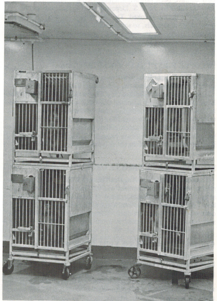
Monkeys in Standard Lab Cages: Copyright: Peter Hamilton: Lifeforce, Canada.

It is obvious that the minds of the review committee were as closed to IPPL's testimony calling for larger cage sizes as are the laboratories where primates are kept incarcerated in such deplorably tiny cages. Such a lifestyle would be considered "cruel and inhumane punishment" for the guiltiest of people, and prisoners thus confined would riot: but innocent primates have no escape and no way to protest and nobody to speak for them but us. So, please do protest and ask others to do so.