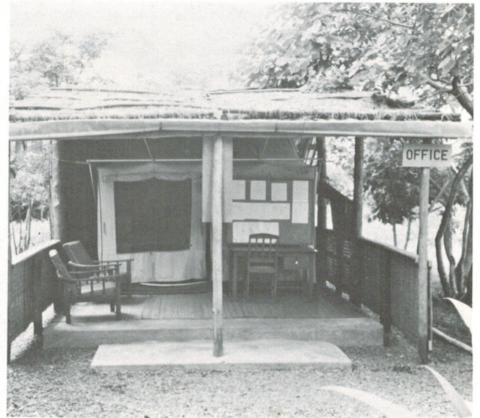
Outamba-Kilimi Park Office.

One final note on the chimpanzee, the official symbol of the Outamba-Kilimi National Park. Because of their human resemblance, both behaviorally and physiologically, chimpanzees have long been trapped for the entertainment and pet industry and for research and experimental laboratories. Now caught as well between environmental and human pressures, the small surviving chimpanzee populations may not last into the 21st century. In order to protect this endangered species, national parks such as Outamba-Kilimi in Sierra Leone, Sapo in Liberia, and Mahale in Tanzania will have to be fully protected and emulated by other African countries still populated with chimpanzees. In addition, chimpanzees can no longer be considered "common property" – there for individuals or corporations to procure because they believe they have the right – regardless of international or national regulations. While in Africa it was difficult for me to witness the plight of orphaned chimpanzees, but each chimp that is killed or captured symbolizes an even greater tragedy . . . the contracted bridge to extermination.