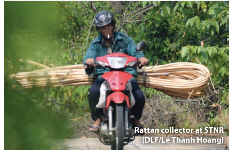
Rattan collector at STNR

permitted this collection because they believe these resources were unimportant and their collection will not harm the forest. In fact, collectors often paid rangers for immunity from prosecution or they share the profits from sale of the collected resource.