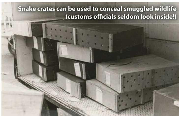
Snake crates can be used to conceal smuggled wildlife (customs officials seldom look inside!)