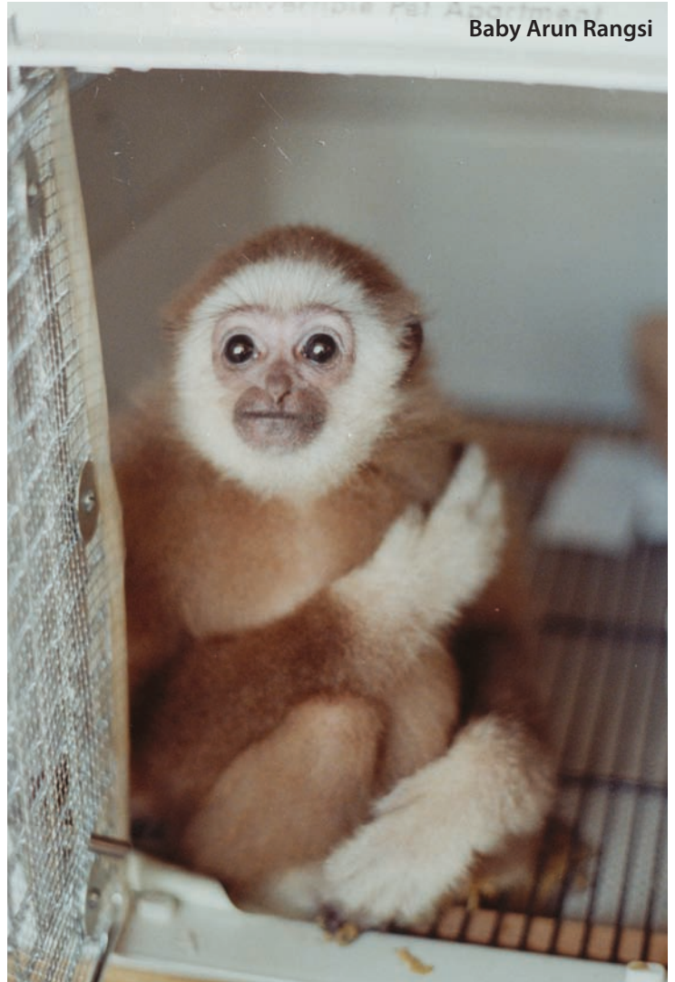
Baby Arun Rangsi