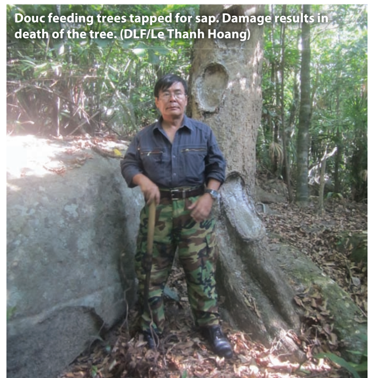
Douc feeding trees tapped for sap. Damage results in death of the tree.