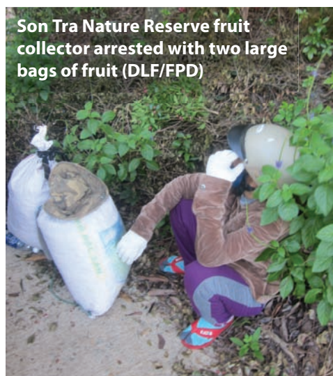
Son Tra Nature Reserve fruit collector arrested with two large bags of fruit

With all DLF's efforts to protect the doucs, habitat destruction is an increasingly serious problem inside reserves