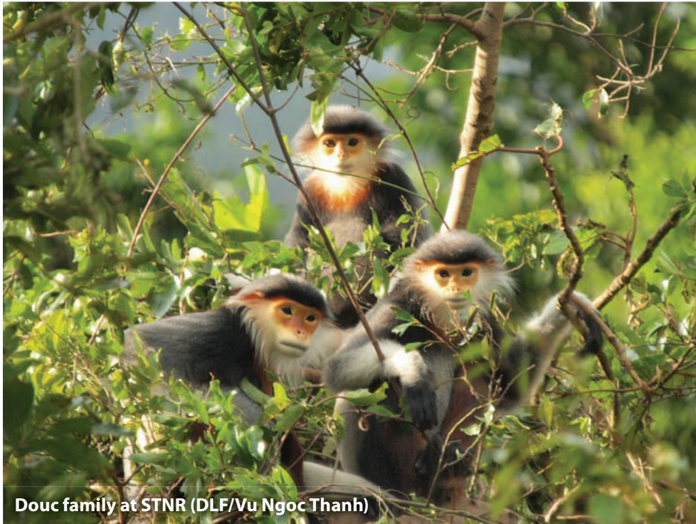
Douc family at STNR