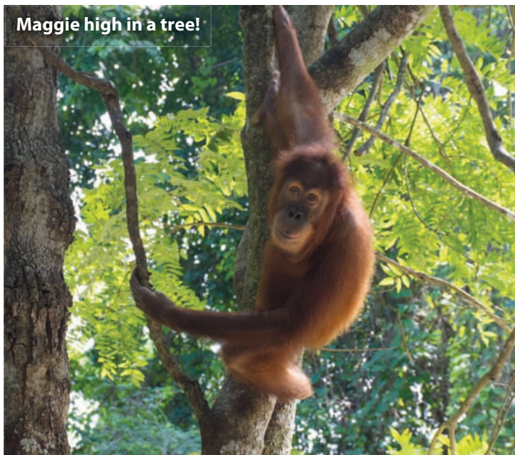
Maggie high in a tree!