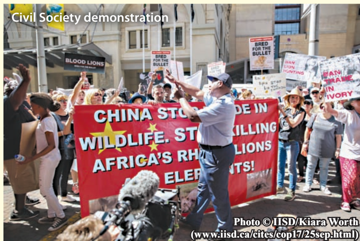
Civil Society demonstration

However, an annual export quota will be established for those same items originating from captive-bred lions, which are plentiful in Southern Africa due to the practice of “game-ranching.” This decision by CITES probably guarantees the growth of even more canned-hunting operations in countries where trophy-hunting is popular.