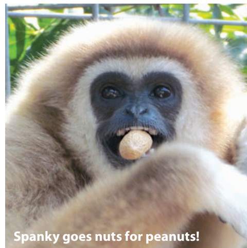
Spanky goes nuts for peanuts!

9 lbs. of specially selected treats for the IPPL gibbons! only $49.70 (includes shipping) www.nuts.com/gifts/nutsforbirds/ippl.html