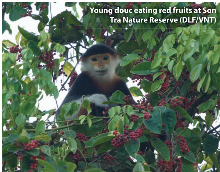
Young douc eating red fruits at Son Tra Nature Reserve

Tra. We have also developed strategies to directly protect doucs that include douc protection teams which follow doucs daily to protect them from hunters, poachers and resource collectors.