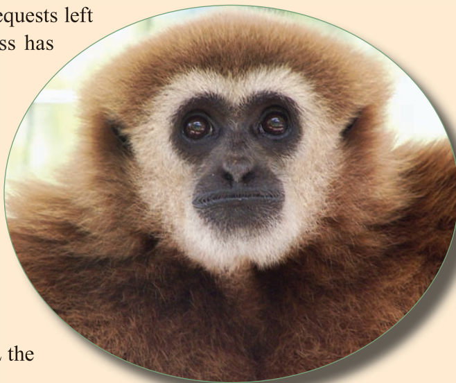
Arun Rangsi, rescued from a lab

Some of our bequests have come from people who have only been able to make small donations during their lifetimes. Others honor friends. For some, there are tax advantages to making bequests to charities.