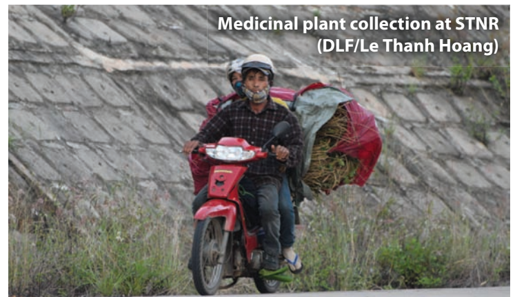
Medicinal plant collection at STNR (DLF/Le Thanh Hoang)