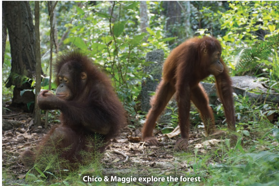
Chico & Maggie explore the forest