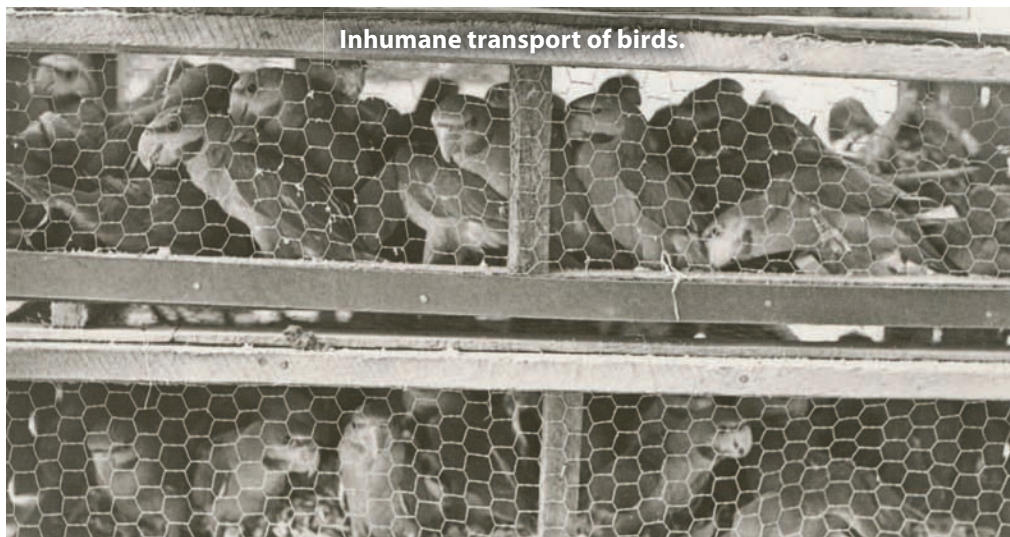
Inhumane transport of birds.

impassioned about stopping the export of their homeland's wildlife.