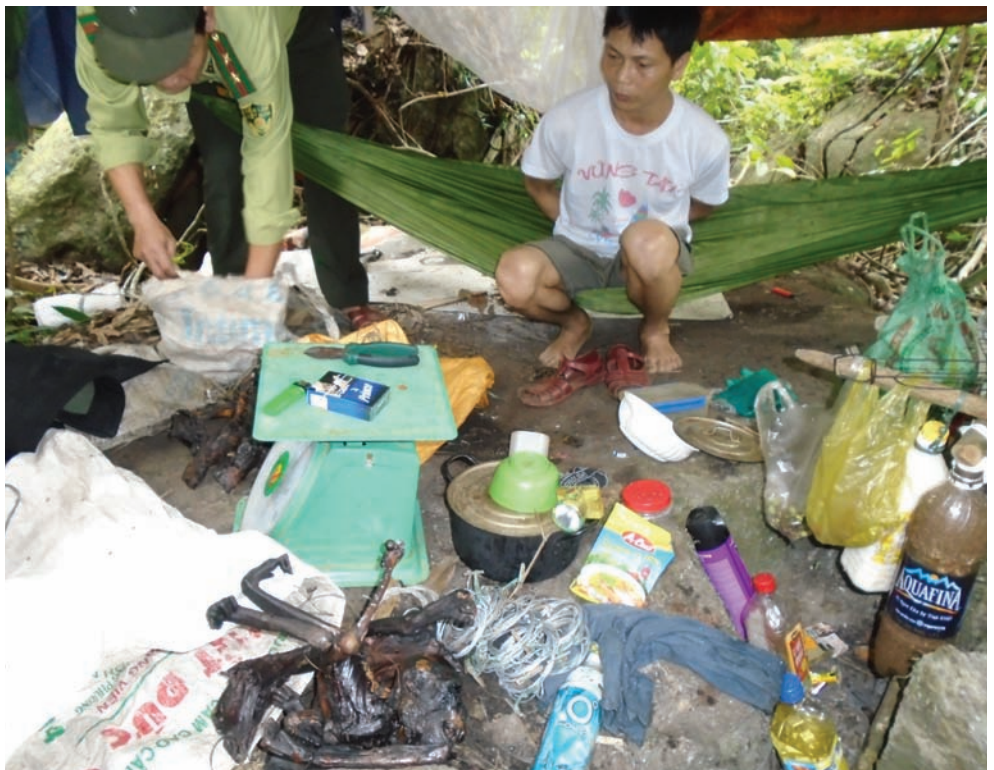
One of three douc poachers arrested after large reward posted by DLF (FPD/DLF). Charred bones of 5 doucs in the foreground.

As a result of this amazing discovery at Son Tra Nature Reserve, DLF was officially founded the following year (in 2007) because no other agency was focusing on protecting these doucs. Since our founding, the DLF has undertaken research activities, educational projects, awareness raising campaigns, eco tourist guide training, and rescue and conservation activities at Son