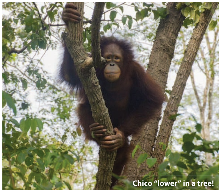
Chico “lower” in a tree!